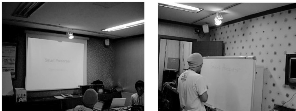
Fig. 5. Snapshots of Smart Presenter implemented on a smart room. The left picture shows a presentation situation and the right picture shows a situation that a presenter approximate the whiteboard.